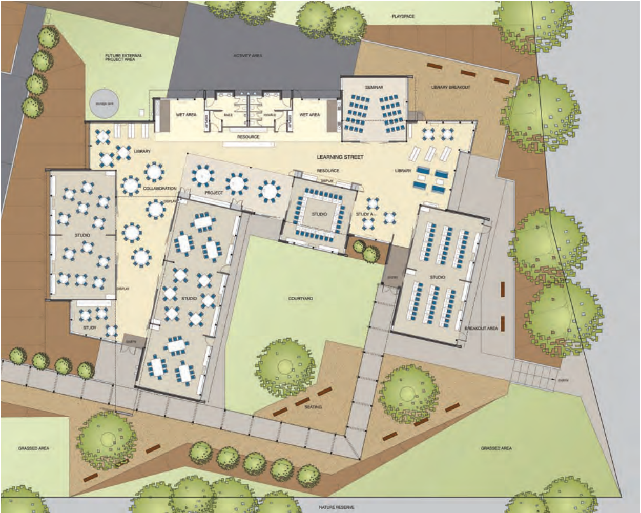
Figure 4. Plan of learning neighbourhood.

have been standard sized classrooms of 63m 2 along travel corridors have instead become a set of varied, integrated learning spaces using the same area. The studios provide home base areas within each of the learning neighbourhoods and create small learning communities. Small group presentation spaces, quiet spaces, project spaces and seamless access to ICT all support a variety of learning activities and student-led inquiry (Figures 5 and 6). By redistributing the area entitlement for art space each neighbourhood has two separate, creative investigative