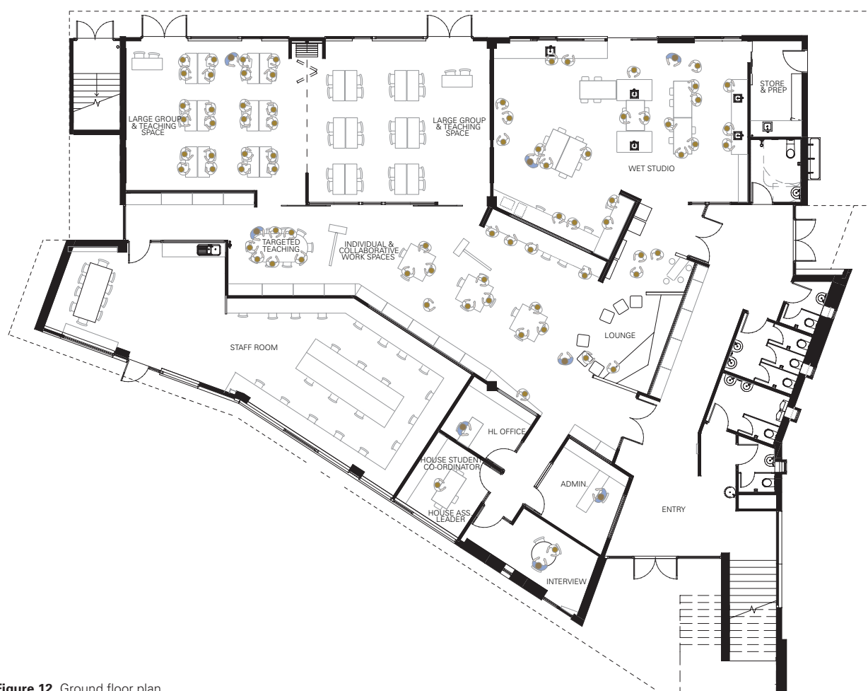
Figure 12. Ground floor plan.