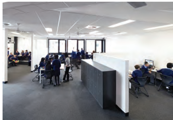
Figure 11. Different learning zones are created with minimal physical intervention.