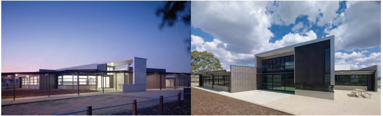
Figure 2. Each learning neighbourhood incorporates external spaces including courtyards and covered walkways.

The site for Epping Views Primary School was disused farmland north of Melbourne. Unique to this project was the lack of a pre-existing residential community.