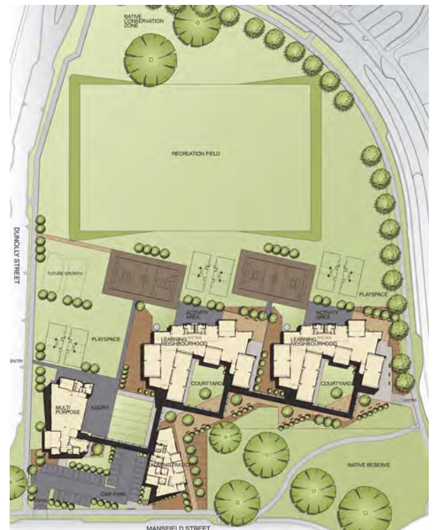
Figure 3. Site plan. The school is structured in two main complexes or learning neighbourhoods linked by all-weather walkways.

Internally, each building has a unique colour and palette of finishes to help personalise and establish a specific identity within the broader school community. What would