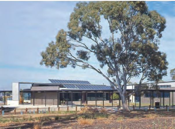
Figure 1. A key driver of the design was integrating the school into its environment giving access to the nature reserve with significant native species such as red gum trees.