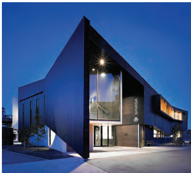
Figure 7. Entry to one of the seven houses.

Three high schools were amalgamated to create the current Dandenong High School. A large proportion of the students are from non-English speaking backgrounds and many are new immigrants. Merging three schools provided considerable challenges to an inclusive, collaborative process, not only in terms of honouring the traditions and cultures of each of the schools whilst creating a new school and new culture, but in dealing with the sense of loss experienced by each of the school communities. Absolutely crucial to the Dandenong High School success is the synergy achieved through collaboration between effective school leaders, responsive architects, imaginative designers, flexible DEECD facilities planners, teachers who were willing to learn, enthusiastic and appreciative students and a committed wider community. The driving force throughout has been a focus on ensuring that the vision and values established by the whole school community is realised. Every aspect of the educational design has been redeveloped including leadership (staff and student), organisational structure, curriculum, pedagogy and facilities.