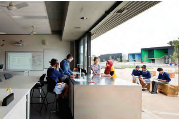
Figure 10. External spaces can become an extension of internal spaces.