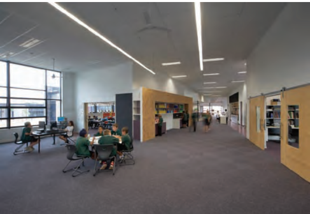
Figure 6. Large multipurpose space.

A shared central agora, located north of the multipurpose building, provides a focus for whole school community building and allows for more formal gatherings, performances and recreational activities.