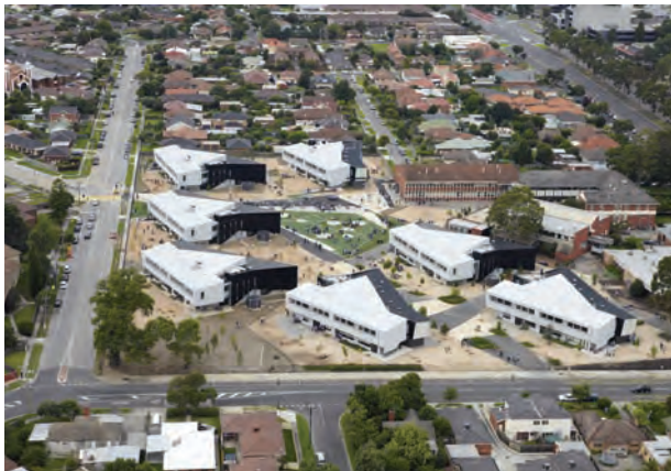
Figure 8. Dandenong High School is divided into seven houses.

they would want to engage the students in, the types of learning settings that would support those activities, the number of students involved, and the number and type of spaces that needed to be available simultaneously. This process generated many ideas for the designer to work with and served to transform the teachers’ vision of what learning spaces could be. The school’s principles of learning rather than the designs of the past had become their reference points.