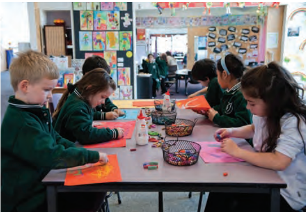
Figure 5. Creative investigative space.

have been standard sized classrooms of 63m 2 along travel corridors have instead become a set of varied, integrated learning spaces using the same area. The studios provide home base areas within each of the learning neighbourhoods and create small learning communities. Small group presentation spaces, quiet spaces, project spaces and seamless access to ICT all support a variety of learning activities and student-led inquiry (Figures 5 and 6). By redistributing the area entitlement for art space each neighbourhood has two separate, creative investigative